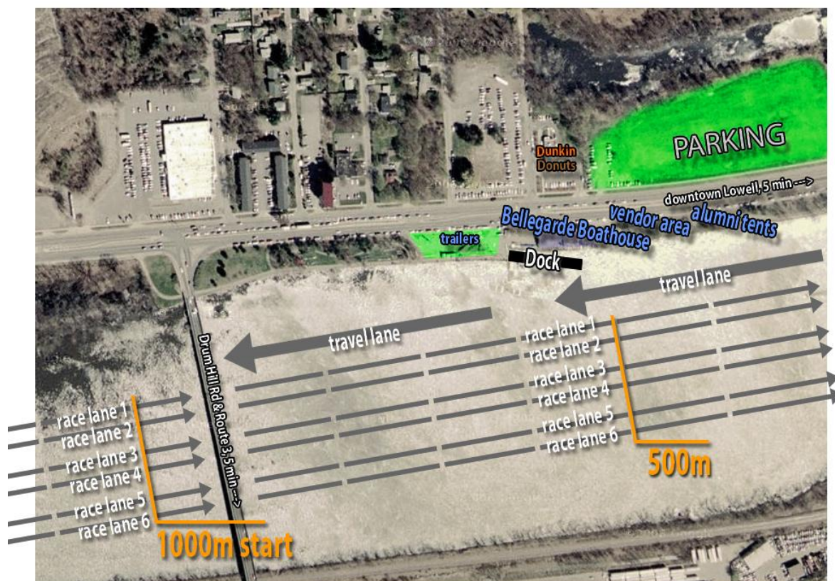
MRRA Festival Regatta Area Map