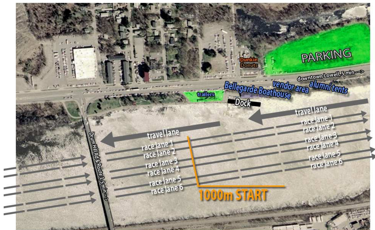
MRRRA Festival Regatta Area Map